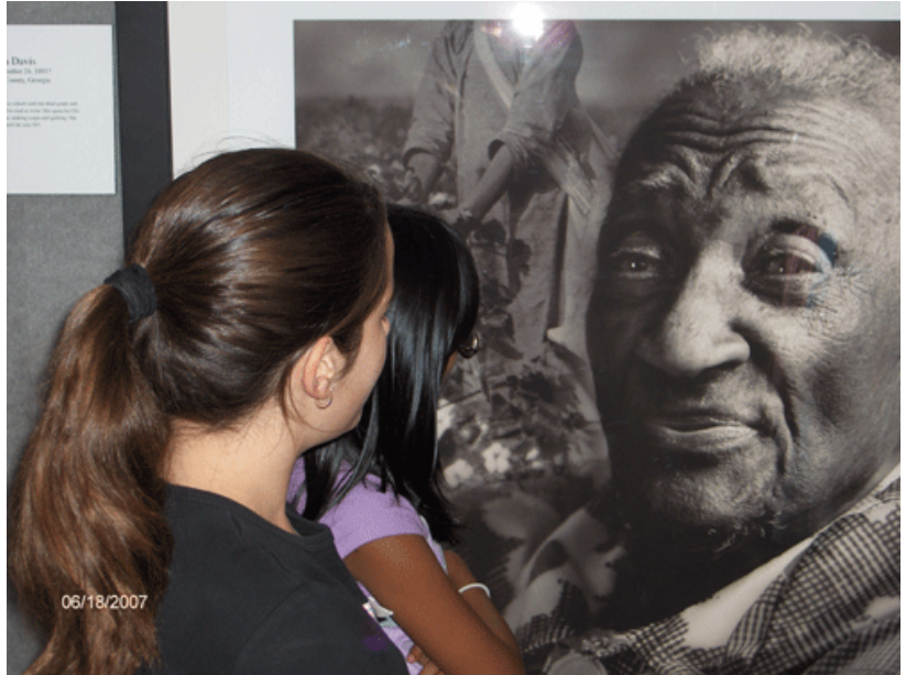
Children view the Earth's Elders Exhibit at the State Capitol.

grassroots approach to bring about a major paradigm shift in how we in society view people of advanced years and include them in our lives."